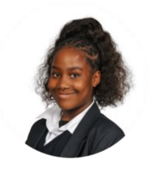
SPARX Reader leaderboard:1. (Yr7)